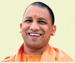
Yogi Adityanath Chief Minister, U.P.