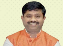
Nand Gopal Gupta "Nandi" Minister of Industrial Development, U.P.