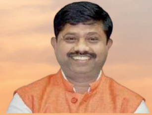
Shri Nand Gopal Gupta "Nandi" Minister of Industrial Development, U.P.