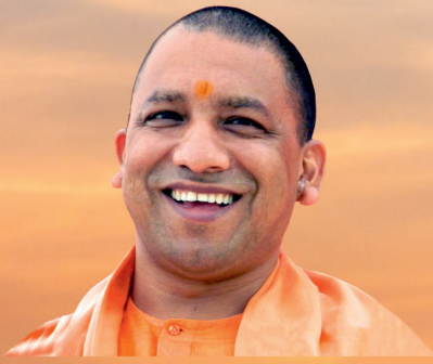
Shri Yogi Adityanath Chief Minister, U.P.